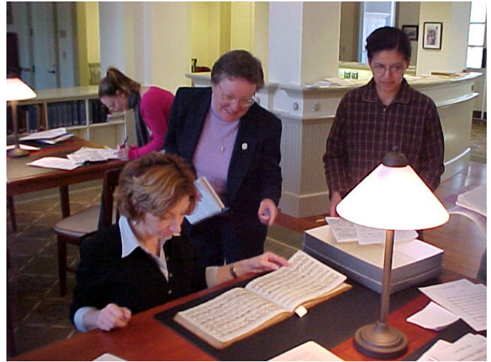
Graduate music editing class from the North Carolina School of the Arts, looking at manuscripts they're editing

If there's anything that should be changed, we would be very grateful if you'd take a moment and let us know. You can call either office (336-725-0651, or 610-866-3340); you can e-mail ( bwall@mcsp.org ); you can write (457 South Church Street, Winston-Salem, NC 27101); you can go to our web site and e-mail us from there ( www.moravianmusic.org ). Just do let us know! Help us get it right!