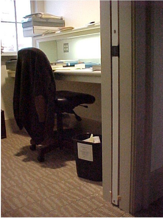
Philip's room, complete with “superfluous materials file”