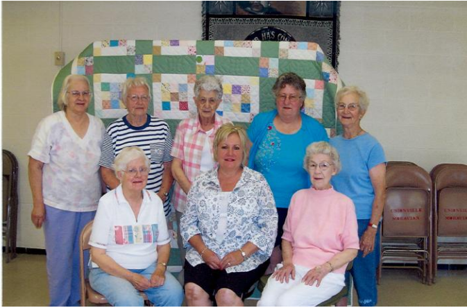
Moravian Quilters from Unionville, Michigan

Last September, Unionville Moravian Church hosted a benefit dinner for MMF. A free will offering was received, and the quilt above was "silent-auctioned", with proceeds of $2,058.00 collected to benefit the MMF's endowment fund. Thank you, Unionville Friends!