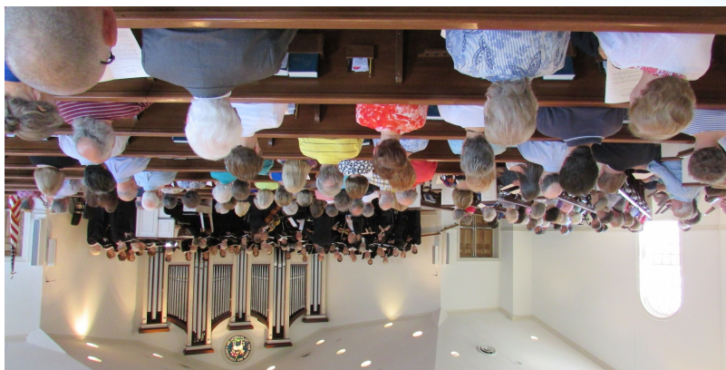
Moravian Chorale sings the Psalm of Joy ode for July 4, 1783 at King Moravian (left), Independence Day service in Salem Square, NC (rt). Below, Bläserstag concert in Neuwied, Germany on the dike (left) and rehearsal in the Saal (right).