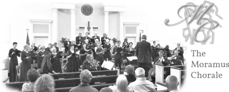
The Moramus Chorale