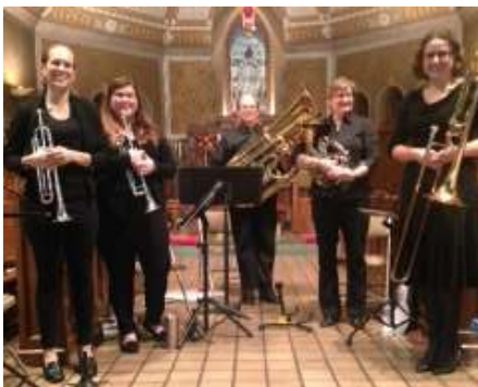
The Mother Jones Brass Quintet