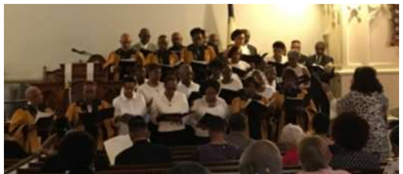
New York Area Moravian Choir