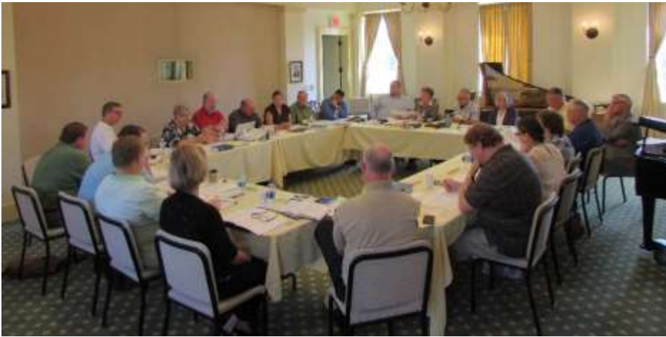
Fall 2018 MMF Board of Trustees in session

The Moravian Music Foundation is blessed with a Board of Trustees filled with passionately dedicated people with varying gifts and interests and a shared commitment to the Foundation's mission. The Moravian Music Foundation's bylaws identify board members as coming to the board in two different ways. Twelve are appointed by Moravian agencies – 3 by the Northern Provincial Elders' Conference, 3 by the Southern Provincial Elders' Conference, 3 by Bethlehem Area Moravians, and 3 by the Salem Congregation. And from 9 to 16 members are elected by the board itself; there is no requirement that these be members of the Moravian Church, and the Board intentionally reaches out to our ecumenical partners to broaden our knowledge and our outreach opportunities.