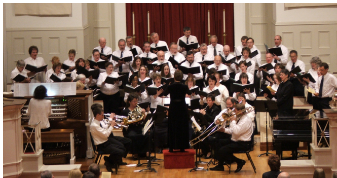
Unitas Chorale in concert, spring 2005 (story continued on page 2)