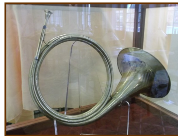
1784 Schmied Horn

For the 2014 Annual Fund appeal, we invited you to consider the 1784 Schmied horn, the subject of the MMF logo. It has dual appeal; its brass exhibits visual splendor of reflected light waves; in the hands of a skilled musician, it reveals a gentle tone of amplified sound waves. It represents the skill and talent of countless musicians who have