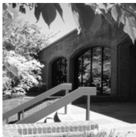
MMF and Moravian Archives Bethlehem, PA