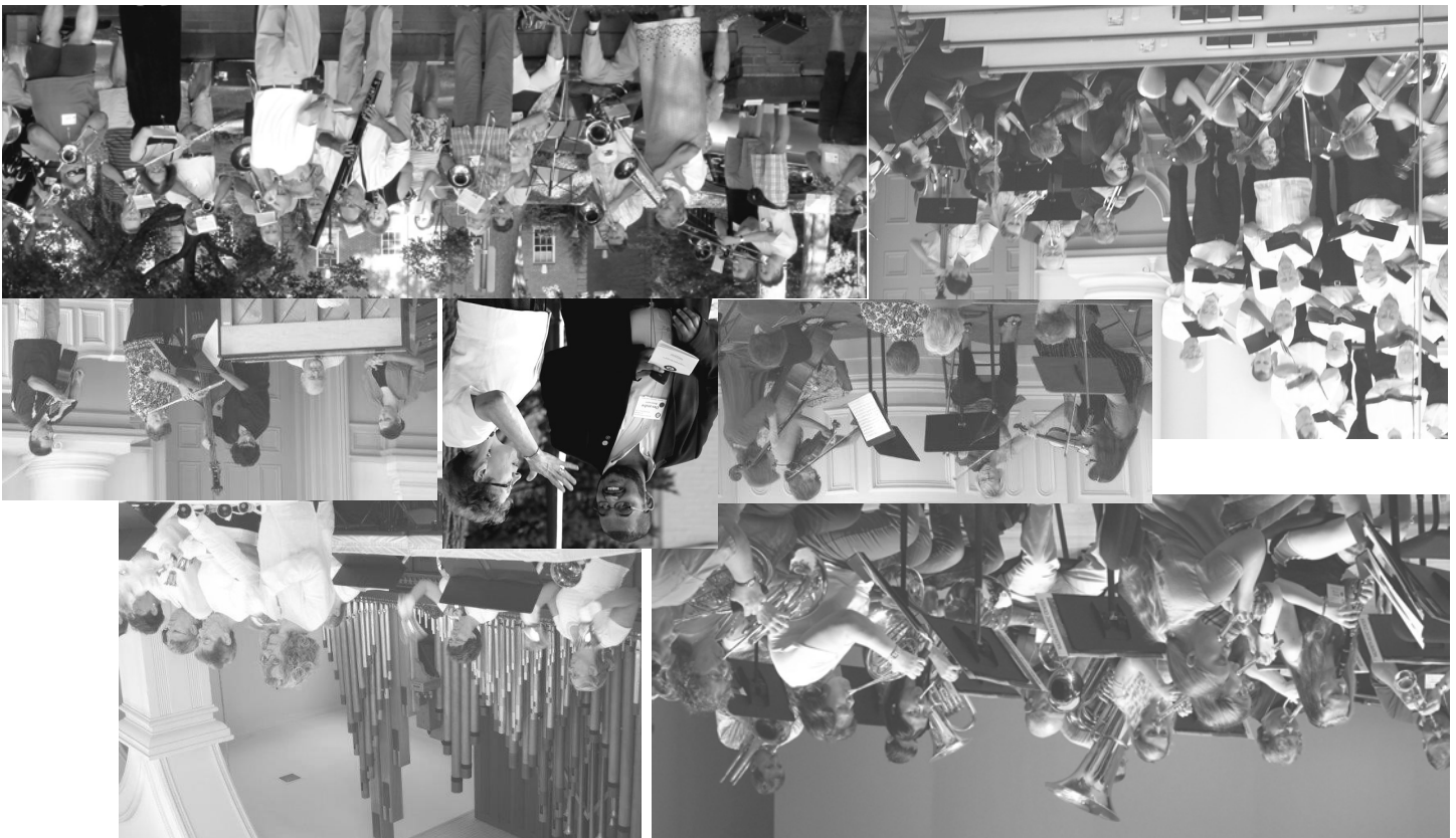
2013 Moravian Music Festival, Bethlehem PA