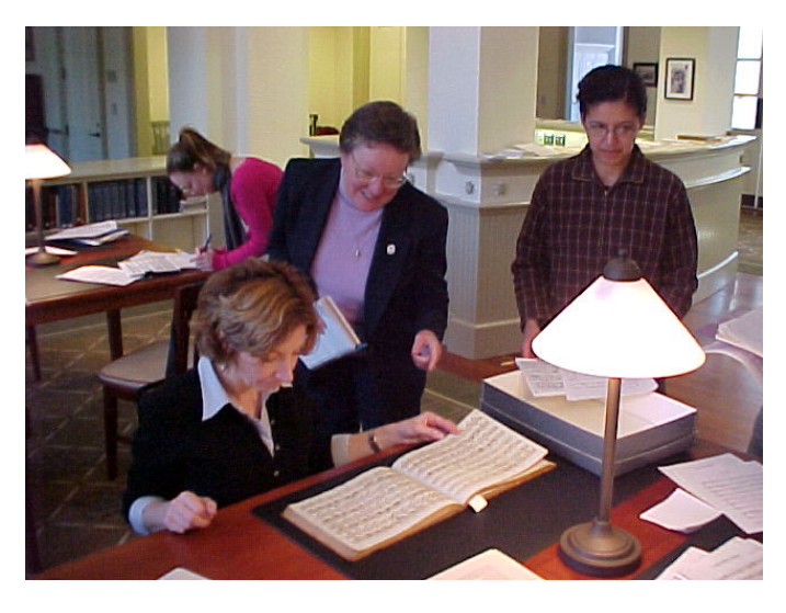
Graduate music editing class from the North Carolina School of the Arts, looking at manuscripts they're editing

If there's anything that should be changed, we would be very grateful if you'd take a moment and let us know. You can call either office (336-725-0651, or 610-866-3340); you can e-mail (bwall@mcsp.org); you can write (457 South Church Street, Winston-Salem, NC 27101); you can go to our web site and e-mail us from there (www.moravianmusic.org). Just do let us know! Help us get it right!