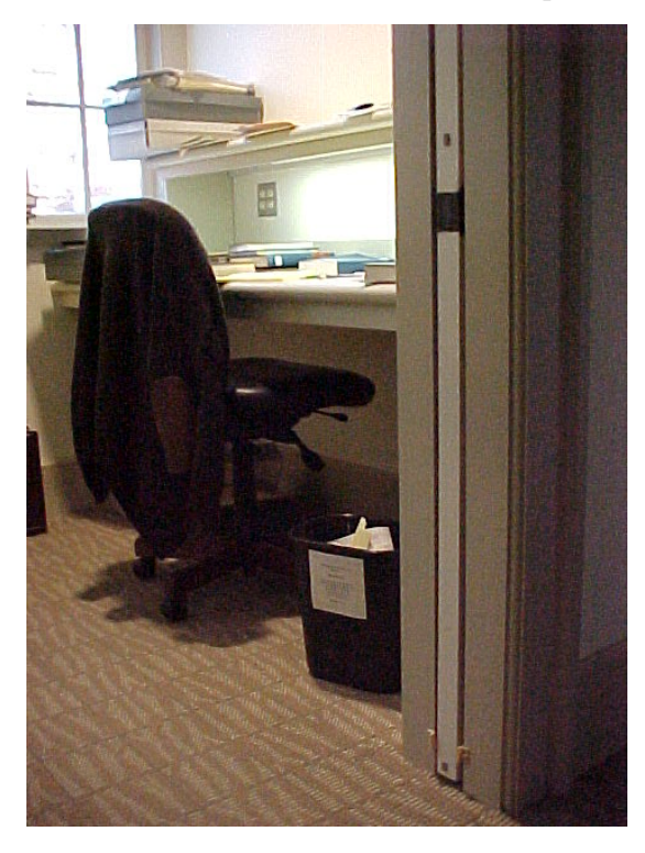
Philip's room, complete with "superfluous materials file"