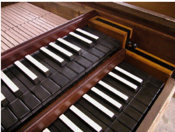
Keyboard of the 1800 Tannenbergs Organ located in the Old Salem Visitors Center Auditorium, Winston-Salem, NC