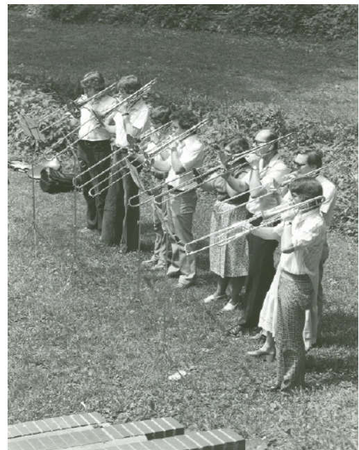
1978 Moravian Music Festival Trombone Choir performing in the May Dell Salem College, Winston-Salem, NC