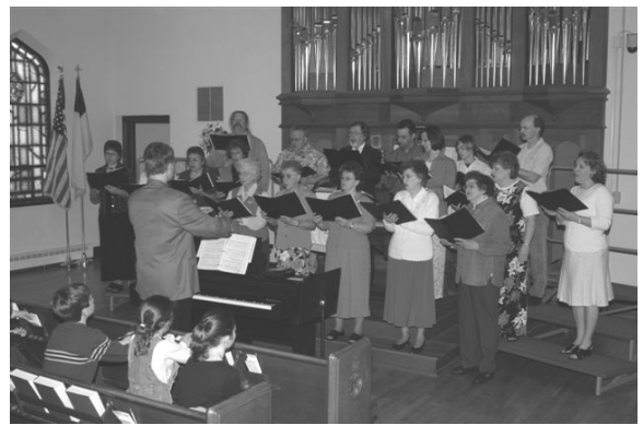
Moravian Music Sunday April 24, 2005

♪ Did you know... Over a third of our annual income comes from individual supporters just like you? A third of our income also comes from our investments and endowments. Less than a third comes from support from the Moravian Churches, grants for on-going and special projects, and sales and royalties. Our circle of friends includes Moravians, non-Moravians, church musicians, professional musicians, researchers, and people who just like music for music's sake! You don't have to be Moravian or a musician to appreciate and support the work of the Moravian Music Foundation. Please consider returning the gift card on page 7 with a check or visiting the "Support" page on our website to donate with a credit card through PayPal.