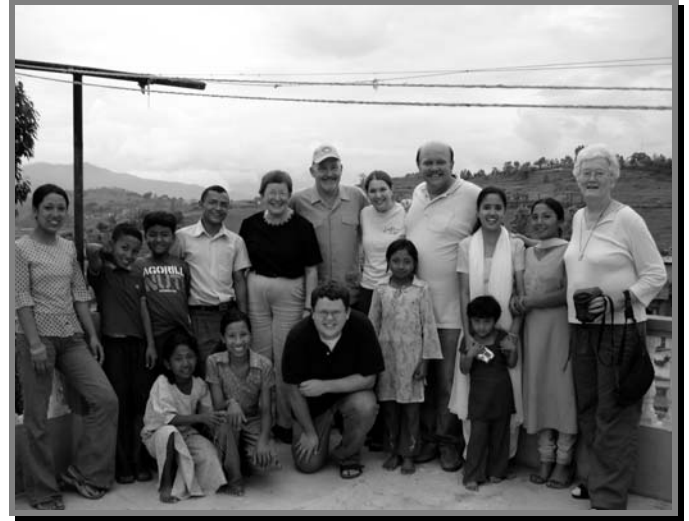
The Nepal Music Mission Team with some of their new friends. See story on pages 1 and 2.