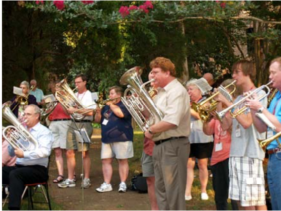
What's a Moravian concert without a band prelude?