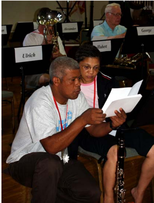
Checking notes and rhythms: Festival band rehearsal. See inside for more photos and stories!