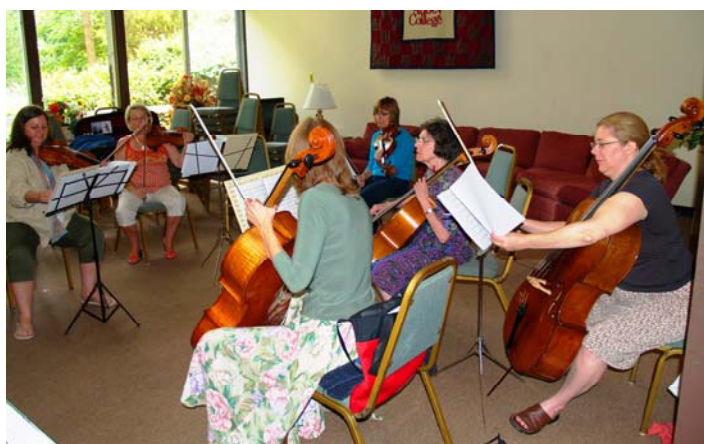
Festival orchestra members enjoyed chamber music in the Chi Ro House. Next festival, listen for a concert of chamber music performed by members of the Festival orchestra! AND ... please let us know of Moravian string players you know, and encourage them to apply to be a part of the Festival orchestra!