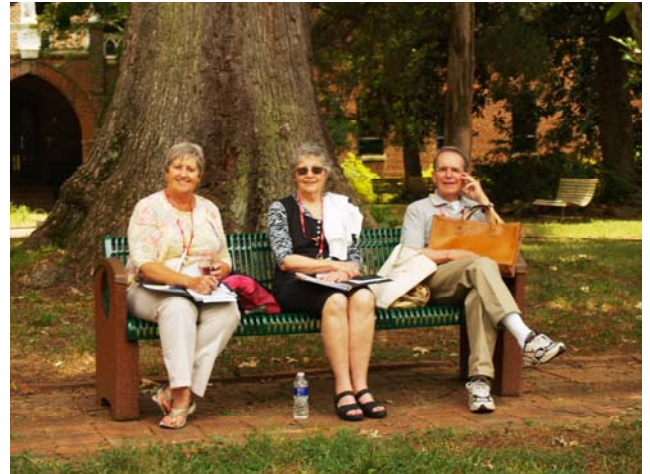
Music, water bottle, and a shady bench – what better way to enjoy a break during Festival week!

The 24 th Moravian Music Festival will be in Bethlehem, Pennsylvania, in the summer of 2013. It's not too early to plan to be present!