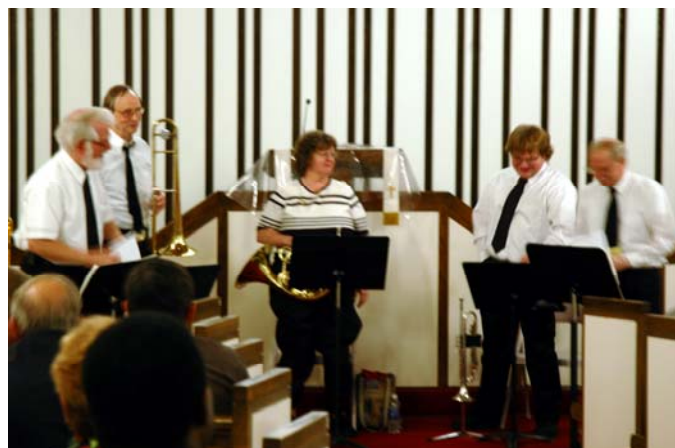
Brass quintet members take a well-deserved bow