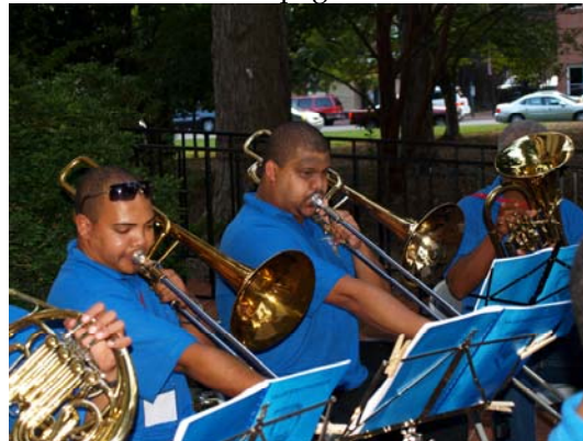
Members of the Salem Moravian Band, Port Elizabeth, South Africa, performing at the Moravian Music Festival

Festival , held at Belmont Abbey College, Belmont, NC, was what we've come to expect Festivals to be: filled with music, fellowship, rehearsals, concerts, too many wonderful programs to fit them all in... See pages 8-9 inside for more!