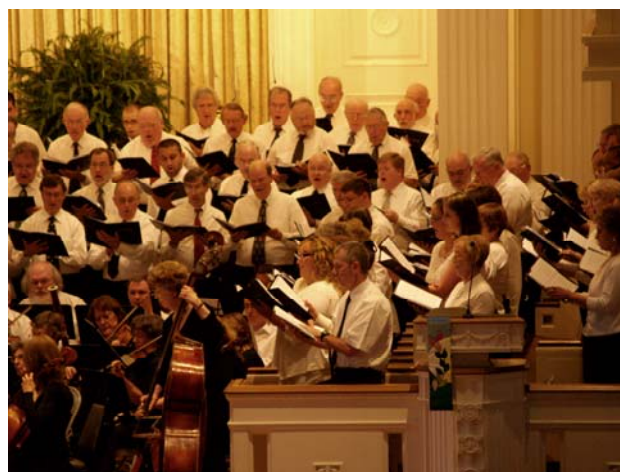
What a choir! This is just the "right half" of them!