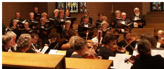
Members of the Moramus Chorale and Festival orchestra performing the Monday night concert