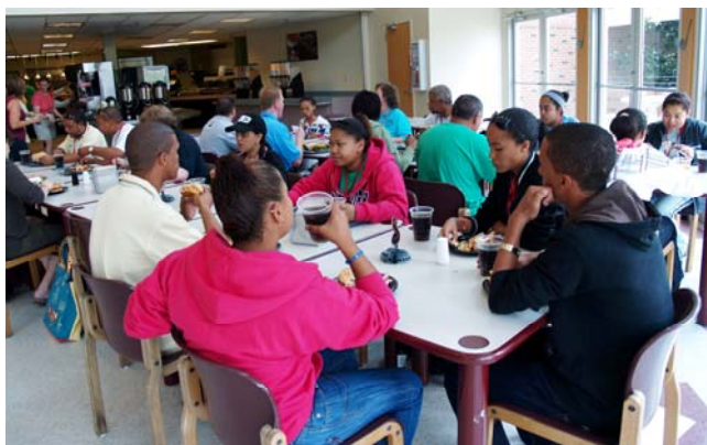
The food was good, the dining staff very helpful, and the butter pecan ice cream unforgettable!