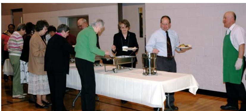
Mmmmm... what looks good? EVERYTHING!