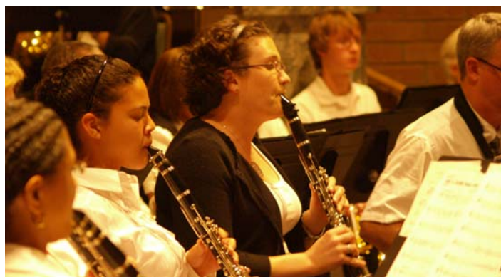
What a clarinet section, in the Festival band!