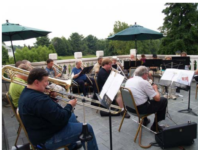
The Festival trombone choir finds an outdoor setting for rehearsing – too bad they were run inside by the rain! It was great to hear them from across campus!