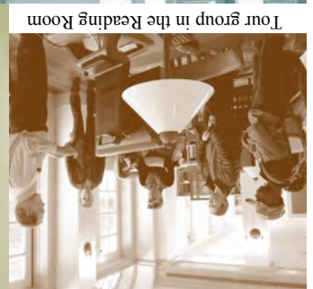
Tour group in the Reading Room

Tours, Classes & the Sing O Ye Heavens Exhibit