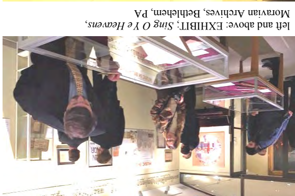
left and above: EXHIBIT, Sing O Ye Heavens , Moravian Archives, Bethlehem, PA